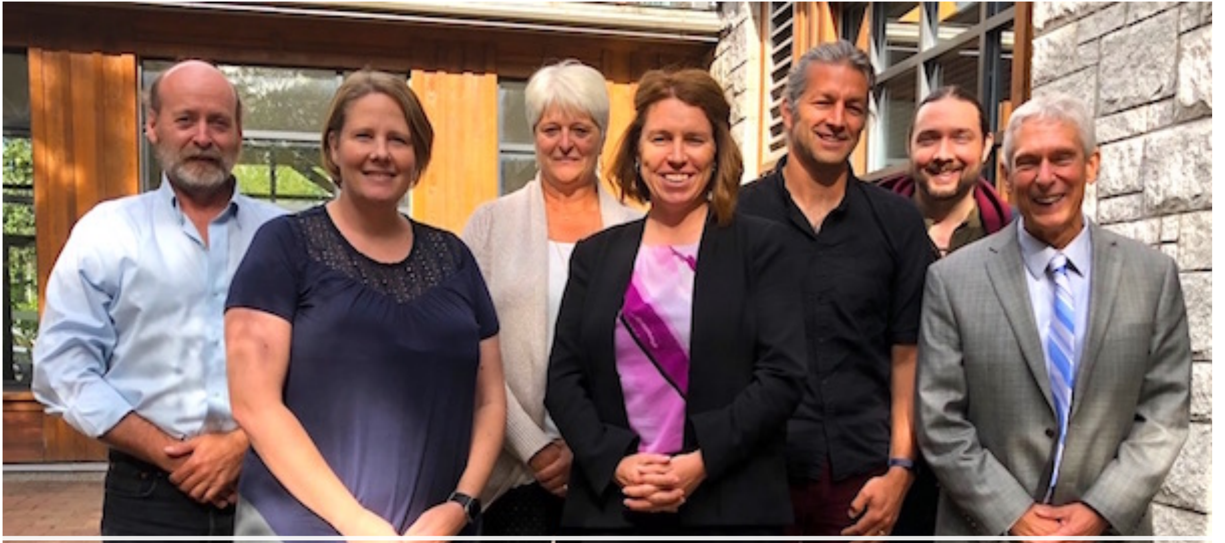
AKBLG – Executive Board